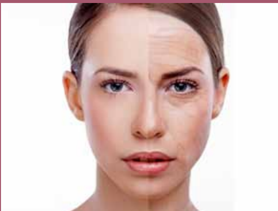
Potential premature skin aging caused by UV damage to the skin