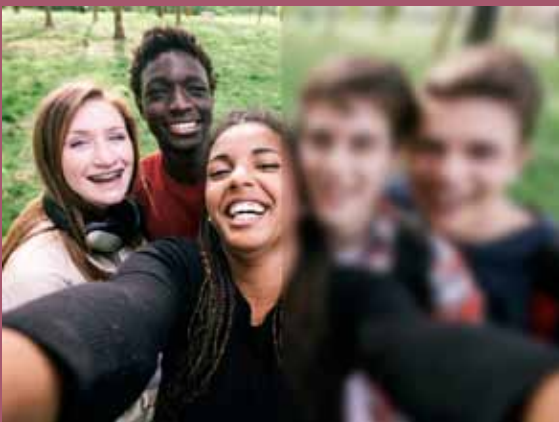
Potential vision loss caused by UV damage to the eye