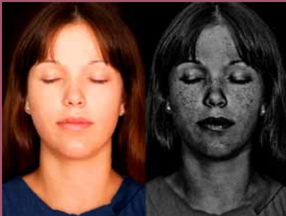
UV photography showing skin damage from UV exposure not yet visible in normal lighting

Short-term cosmetic effects from indoor tanning may be more apparent than the long-term health risks. In addition to increasing skin cancer risk, indoor tanning can lead to premature skin aging, such as early wrinkles and age spots, and potentially blinding eye damage.